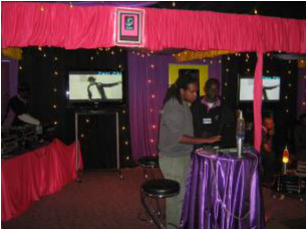
Zain / Airtel - 2009