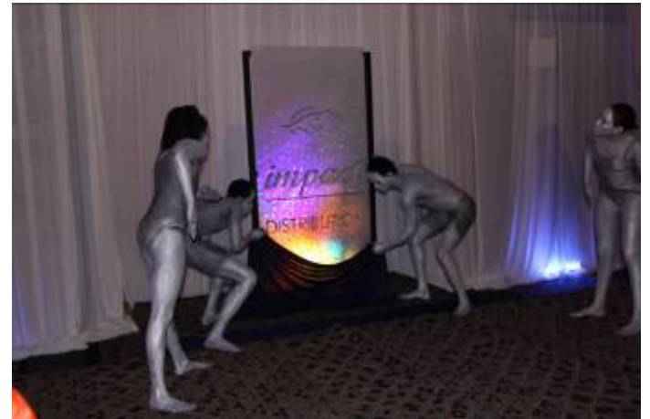
The Events People - 2009