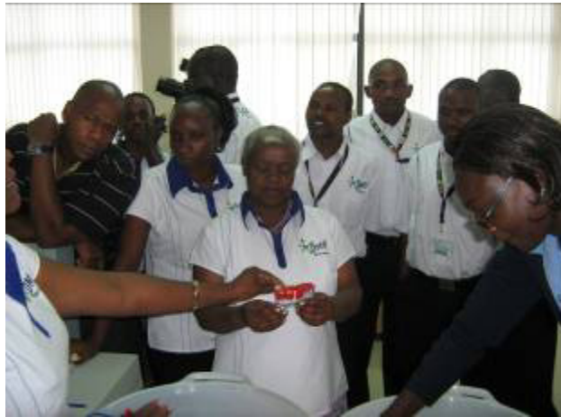
Exp Momentum – since 2003